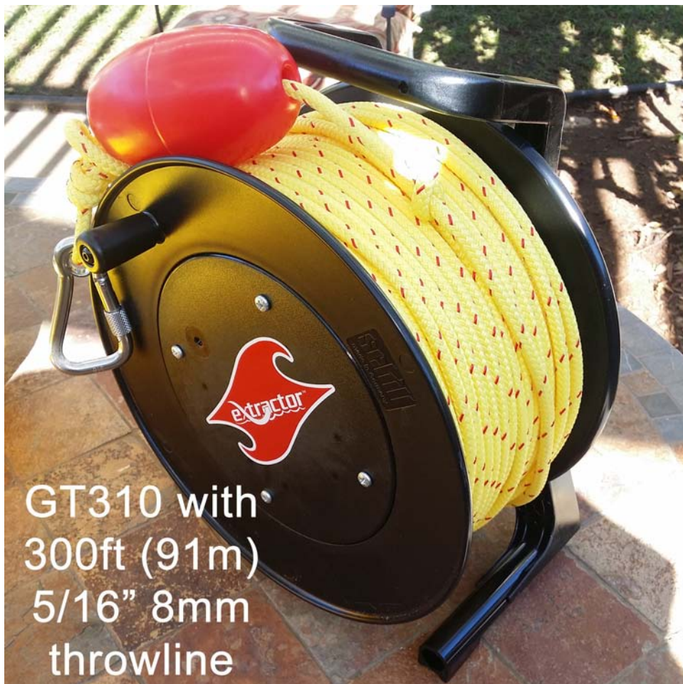
GT310 with 300ft (91m) 5/16" 8mm throwline